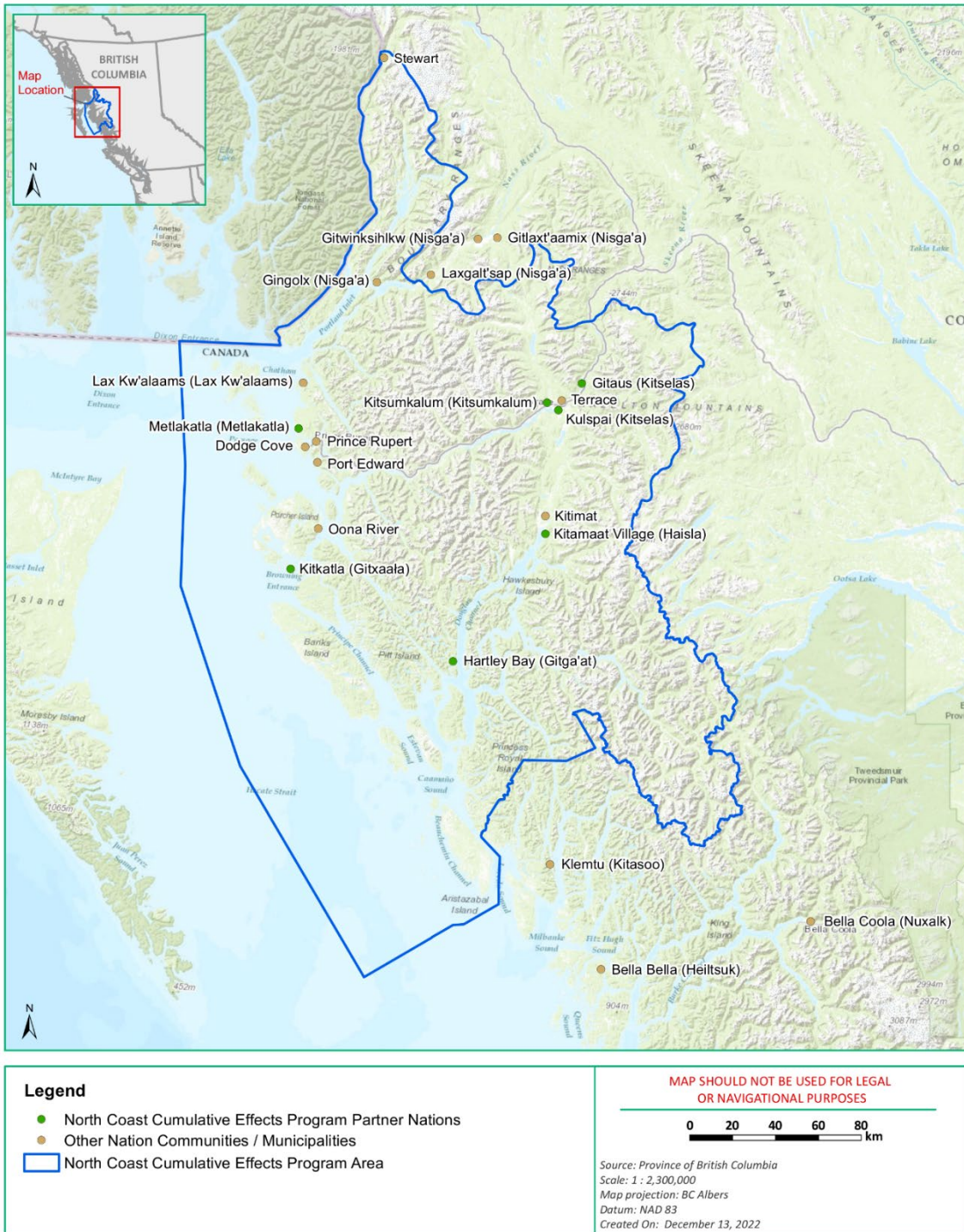
Figure 1. North Coast Cumulative Effects Program area